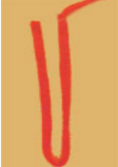
Packaging Net Type

A convenient and easy way of packing fruits, vegetables, mineral water bottles, toys etc. Locking clip cum holding arrangement can also be attached for display.