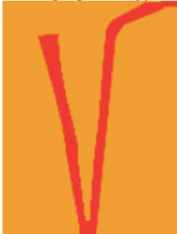
Packaging Net Type II